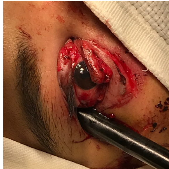
Figure 3. Intraoperative photo showing multiple eyelid lacerations and canthal transection.

noted. The rest of the eye findings remained unchanged.