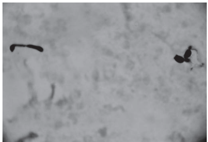
Figure 3. Gram stain microscopy of blood smear at 100x magnification showing Candida in yeast and pseudohyphae forms.