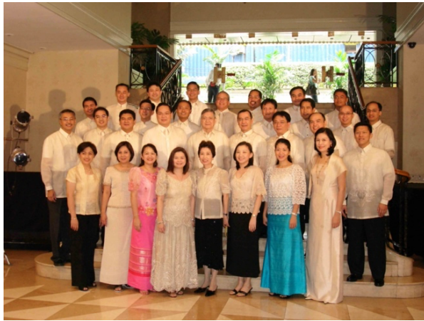
Figure 2. First Philippine Glaucoma Congress 2008, Manila Philippines.

general ophthalmologists from 2009 to 2010 and beyond. These were well attended, establishing linkages with the local chapter societies.