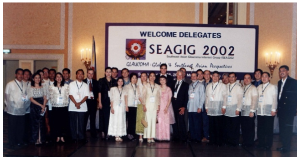
Figure 6. Second SEAGIG International Congress 2002, Manila Philippines.

participated in this 3-day event, bringing to Manila all the experts under one roof to discuss the complexities of glaucoma. It was attended by more than 1,200 local and international participants, plus representatives from many international and local pharmaceutical companies. This event set the stage for the society to collaborate with international societies and leaders in the glaucoma world, such as the World Glaucoma Association (WGA) and the Asia-Pacific Glaucoma Society (APGS), the offshoot of SEAGIG, whose convention occurs once every 2 years. PGS, together with APGS, participated regularly in the annual Asia-Pacific Association of Ophthalmology (APAO) congress held in different regions of Asia with symposia, debates, and workshops. PGS will be the host for the 7th APGS international congress to be held in Manila in 2024.