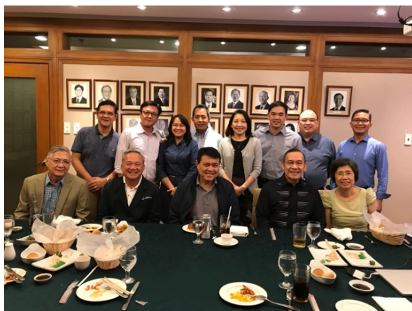
Figure 8. Philippine Glaucoma Foundation fund-raising dinner 2017, Manila Polo Club, Makati.

The Philippine Glaucoma Foundation (PGF) was set up in 2008 by PGS to help fund glaucoma education activities, public awareness campaigns, and subsidize the surgeries of indigent patients. Trabeculectomy and glaucoma drainage device implantation were the two most common surgeries funded, particularly in public institutions. The foundation bought glaucoma drainage devices, such as Ahmed, AADI, Baerveldt, and Molteno to support patients in need. It accepted donations from private groups ( Figure 8 ) and raised funds through 2 golf tournaments in 2012 and 2017, together with the sale of TW steel watches.