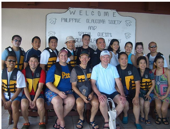
Figure 3. El Nido get-away with special guests 2008, El Nido, Palawan.