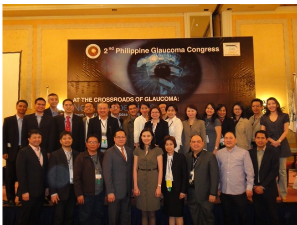
Figure 4. Second Philippine Glaucoma Congress 2012, Manila, Philippines.