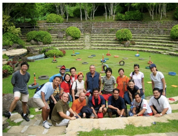
Figure 9. The Amazing PGS Race strategic planning workshop 2006, Tagaytay Highlands.

The PGS, registered with the Securities and Exchange Commission since 2016, has so many achievements in its first 25 years primarily because the members respect each other, recognize the value of each member and their contributions, work harmoniously as a team to accomplish more. To promote the cohesiveness of the society, out-of-town strategic planning activities were conducted over the years to design year-long projects and foster camaraderie ( Figure 9 ), bringing the members to different parts of the Philippines, and rekindling ties with the local ophthalmologists in the area.