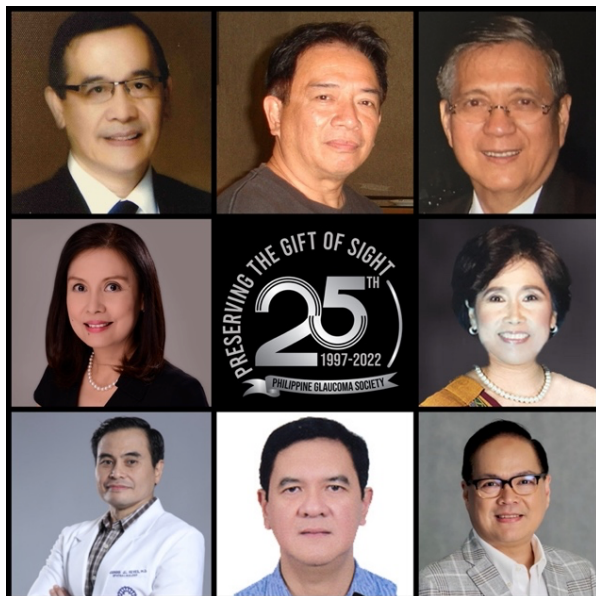
Figure 1. Founding members of the Philippine Glaucoma Society (PGS).