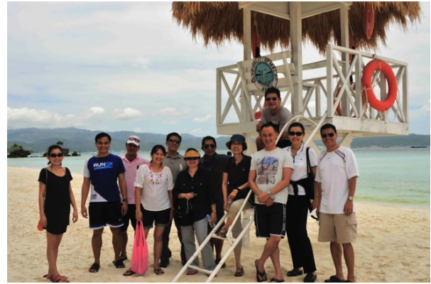
Figure 5. Weekend get-away 2012, Boracay, Aklan.